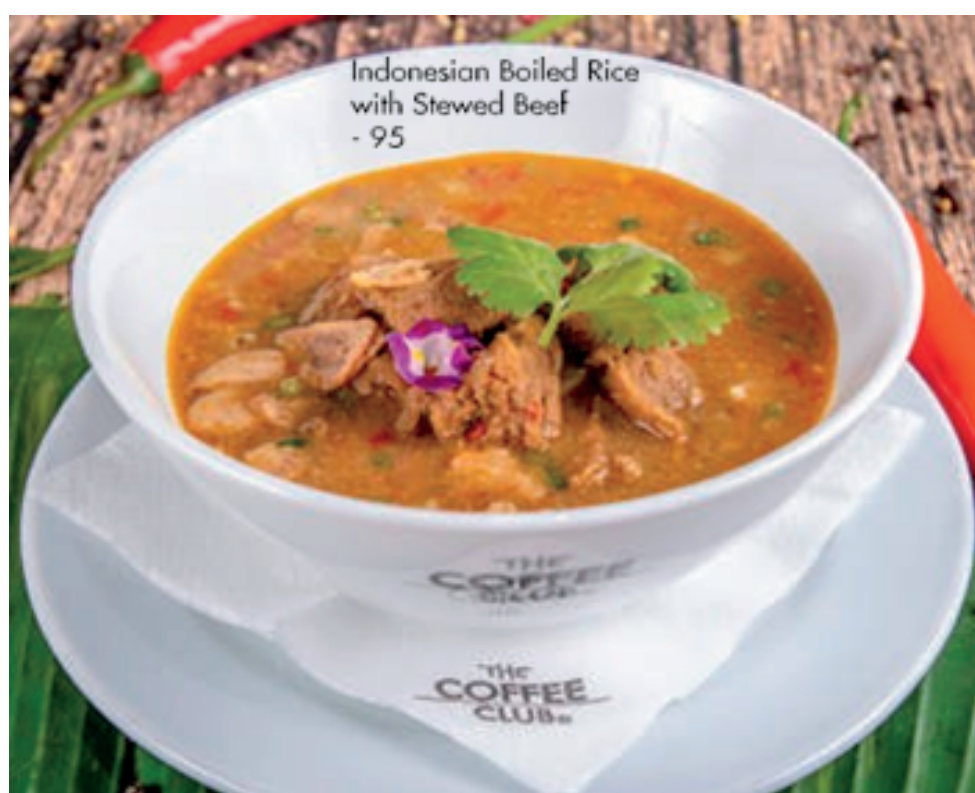
Indonesian Boiled Rice with Stewed Beef - 95