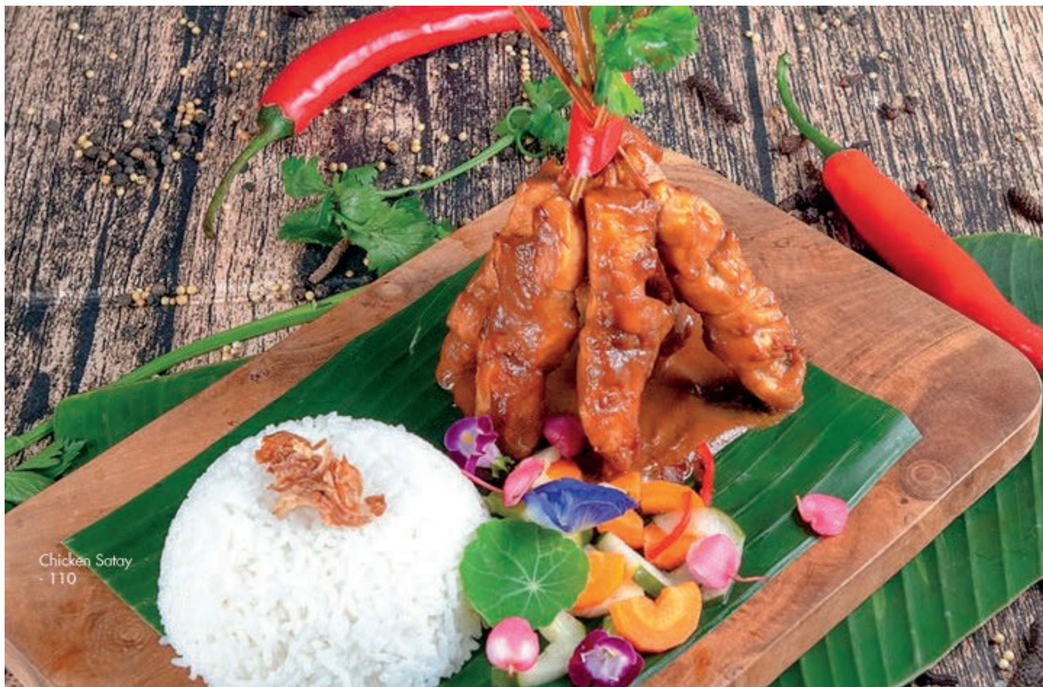
Chicken Satay - 110