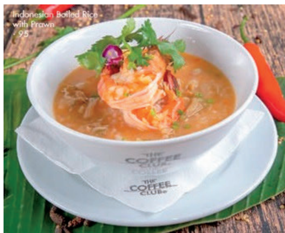
Indonesian Boiled Rice with Prawn - 95

Chicken Satay Chicken skewer with a traditional peanut sauce, steam rice and pickled acar.